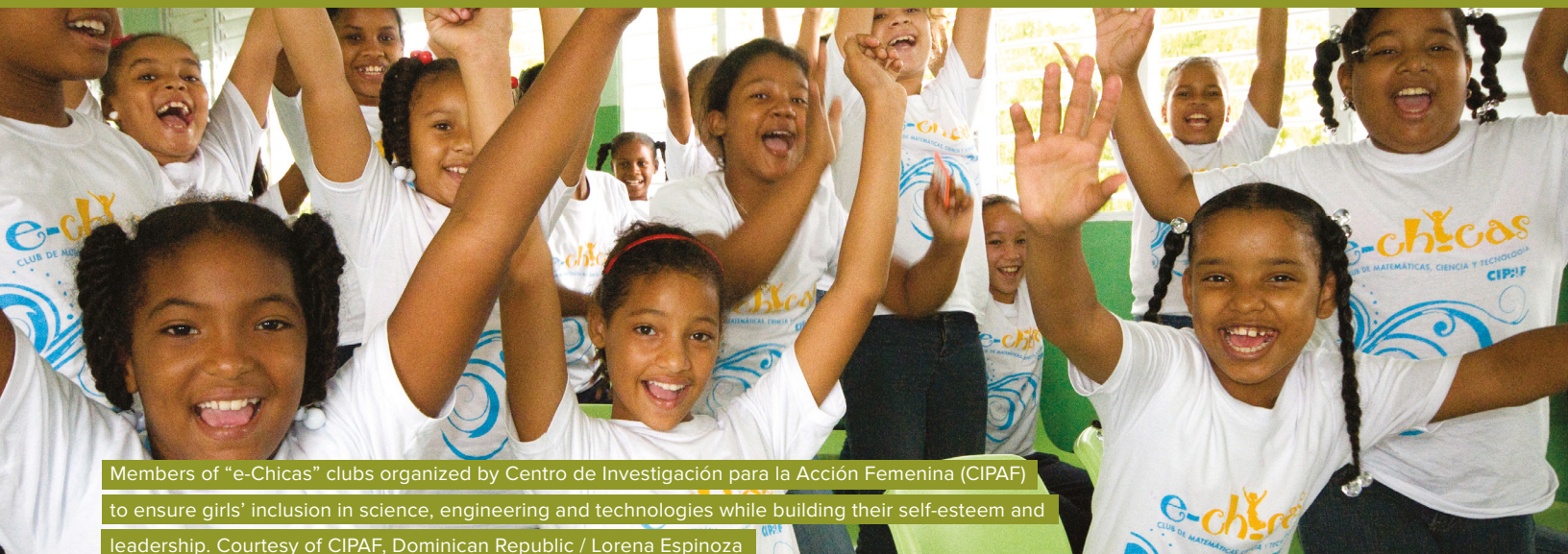
Members of "e-Chicas" clubs organized by Centro de Investigación para la Acción Femenina (CIPAF) to ensure girls' inclusion in science, engineering and technologies while building their self-esteem and leadership.