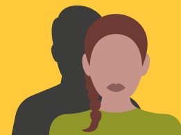
SURVIVORS OF GENDER-BASED VIOLENCE